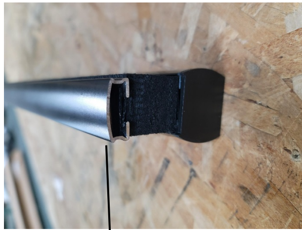
Curved side of hem bar