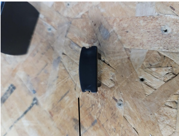
Curved side of end cap