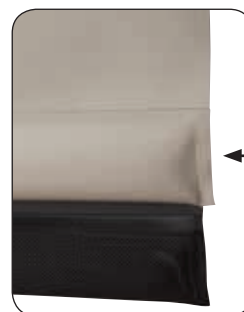
Shade hem bar

For additional technical support, call 574-262-0954.